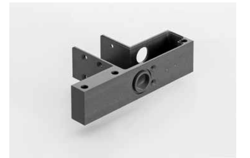
Milled locking bolt housing