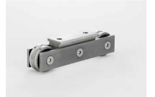
Carriage made of V4A and tempered rollers