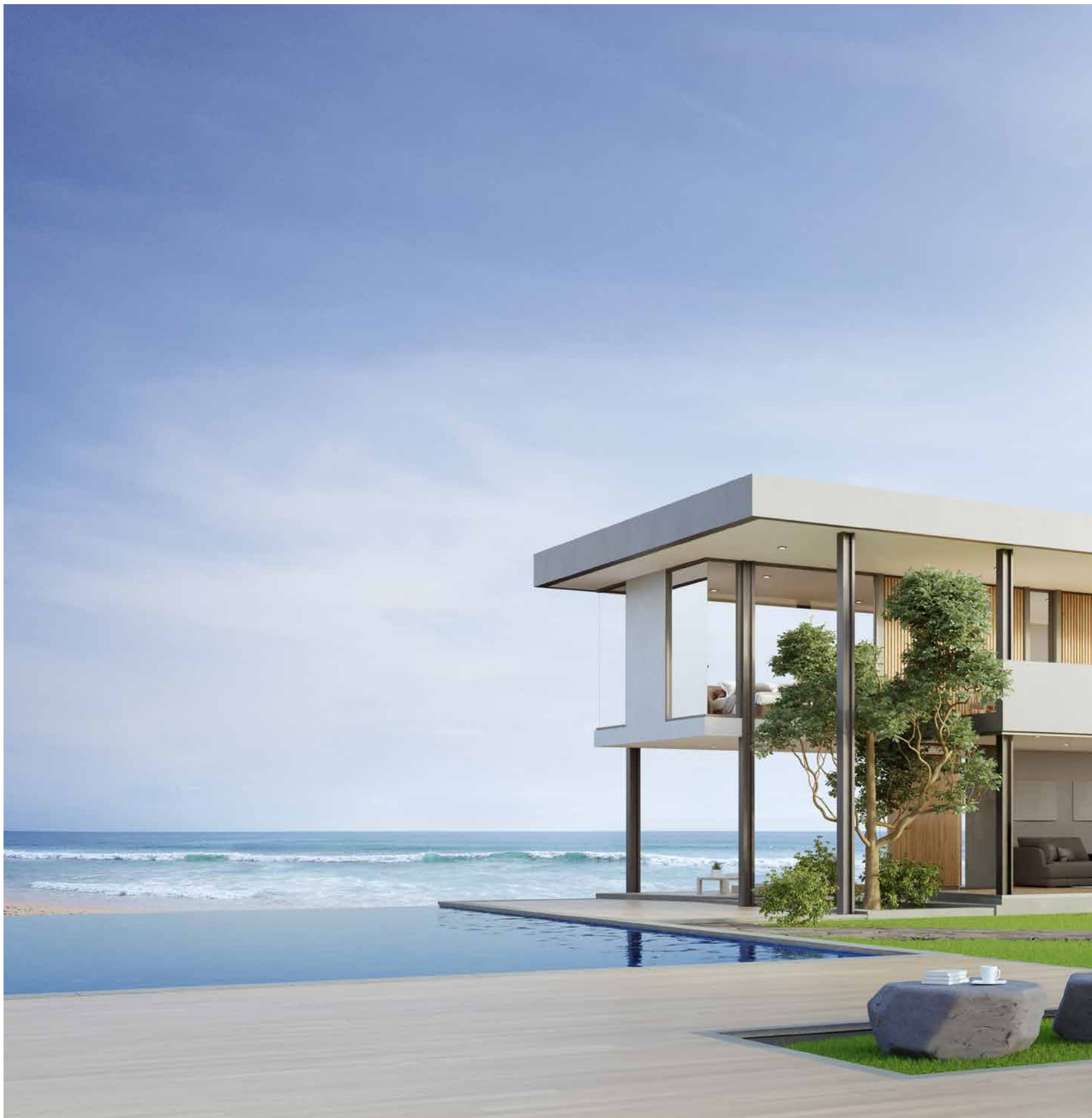
Langebaan, South Africa Private residence, 100 m from the sea

Folio Glass Inc. 702 Oak Grove Ave Menlo Park, CA 94025 USA