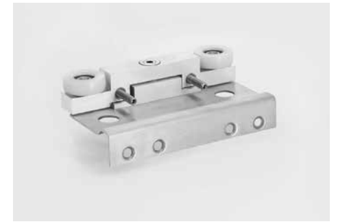
Upper guide carriage made of V4A and anodised aluminium